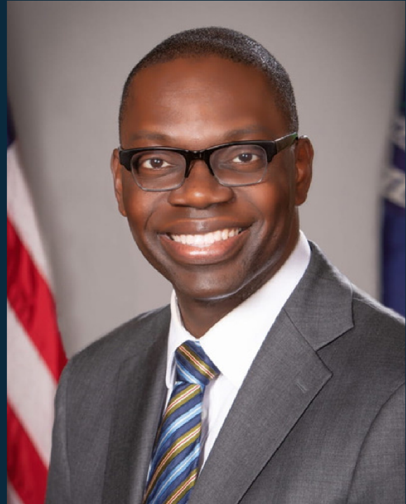
Garlin Gilchrist II Michigan's Lieutenant Governor